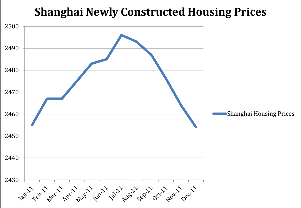
Figure 2: Shanghai Housing Prices 2011